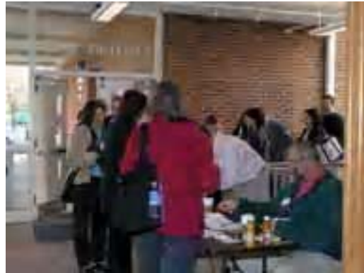
Crowd at Registration