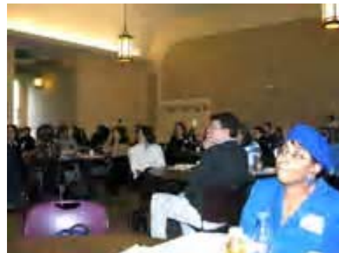
SNCA members enjoying presentation