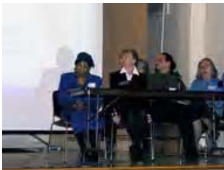
Beyond Books panel members