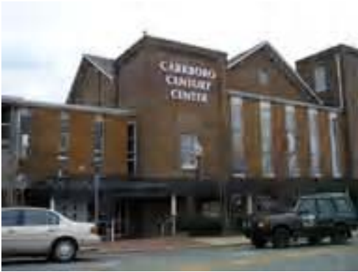
Carboro Century Center